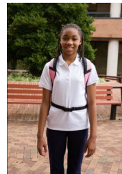
CORRECT Wide, padded straps on both shoulders