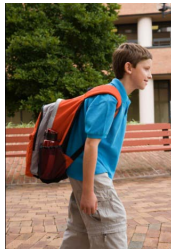
WRONG Load too heavy