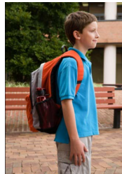
CORRECT Load no more than 10%-15% of body weight